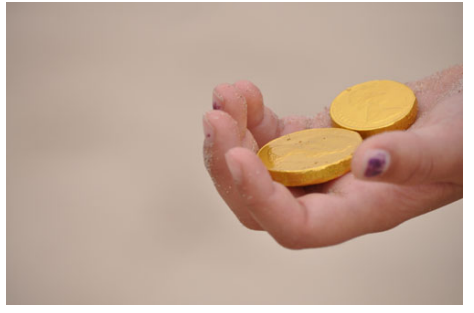
And young sailors hunted for treasure, which they were happy to share.